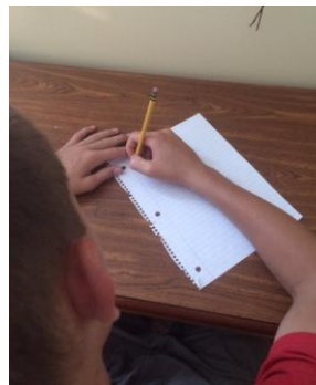
Right hand - angle 30°-45°