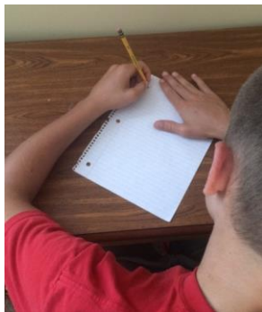
Left hand - angle 20°-45°